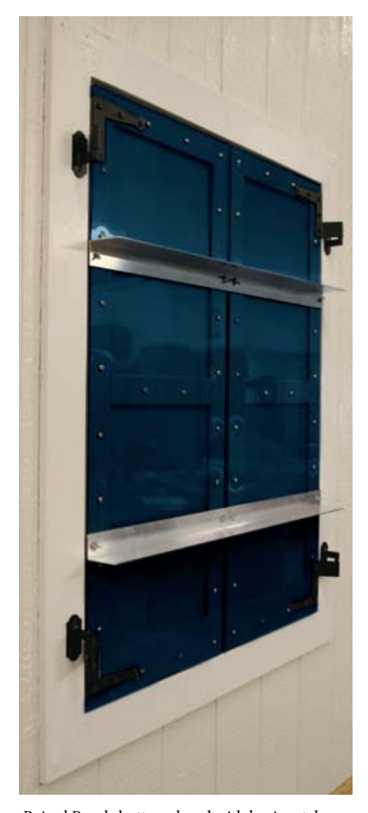
Raised Panel shutters closed with horizontal storm bar system.