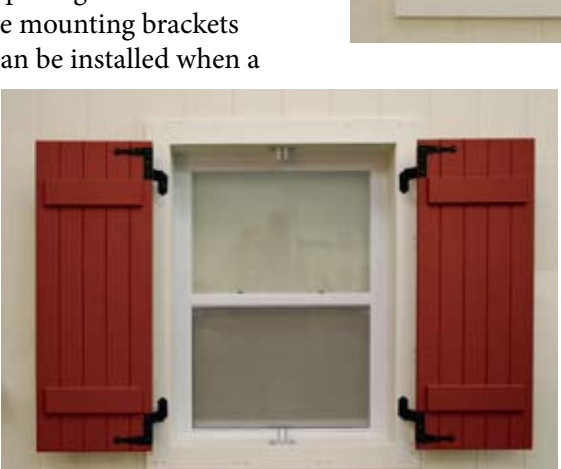
Board and Batten shutters closed with vertical storm bar system.

Storm shutters with the Vertical Storm Bar System have been independently tested to a Design Pressure (DP) of 60 PSF.