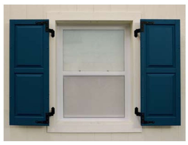
Raised Panel shutters open.