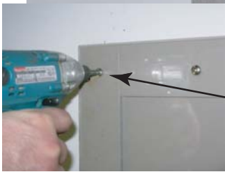
Polycarbonate Mounting Screw