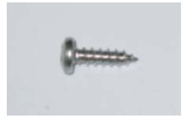
#12 x 1" Screw