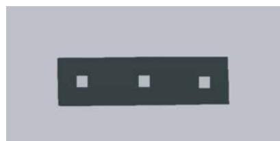
Flat Hinge Backer Plate