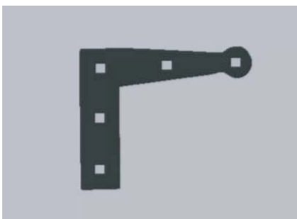
L-Hinge Backer Plate