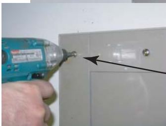
Polycarbonate Mounting Screw