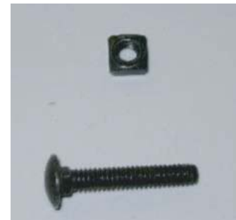
Carriage Bolt and Square Nut